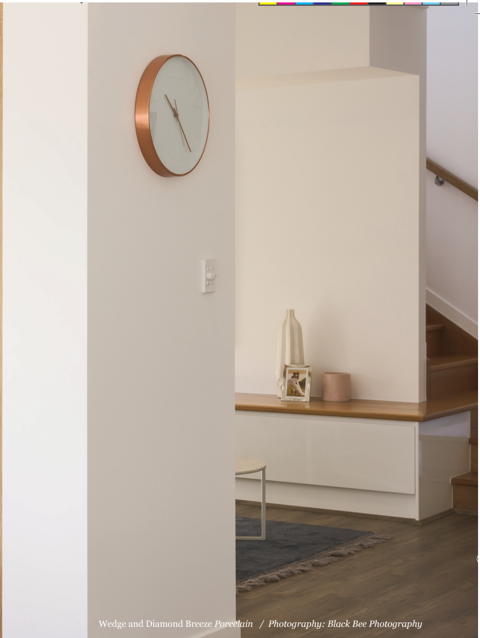
Wedge and Diamond Breeze Porcelain