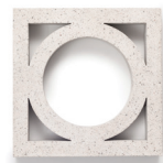
Circle Breeze Size: 90 x 290 x 290mm