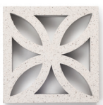
Flower Breeze Size: 90 x 290 x 290mm