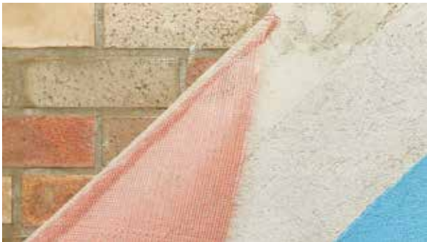
Plaster Feature: Plaster Brick: Plaster brick

The increasing popularity of bagged and painted bricks has meant that some painters have specialised in these brick finishes. When painting over a brick, the bricks need to have cured on the wall with the mortar and be clean, dry and then the correct system needs to be applied.