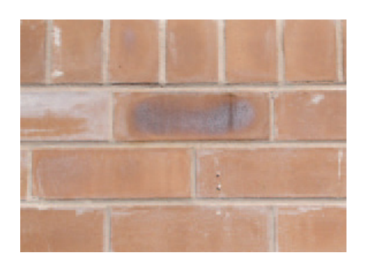
Signs of manganese staining