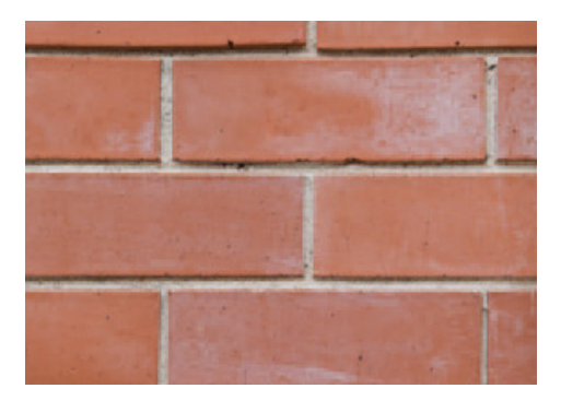
Typical calcium stain from wet sponging mortar joints