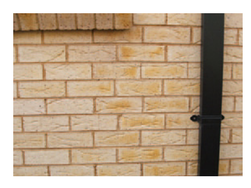
Acid burn on light coloured bricks