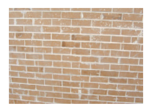
Typical wall after brick laying