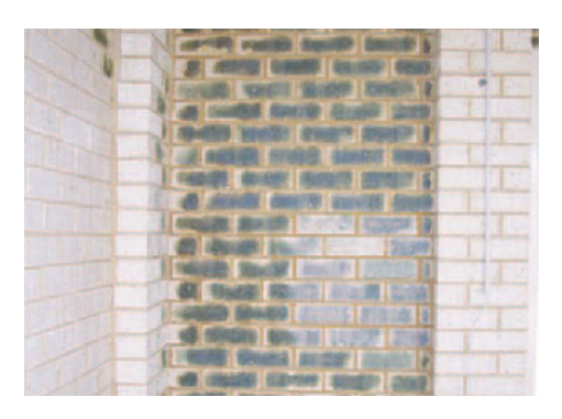
Vanadium stain not removed prior to hydrochloric acid application