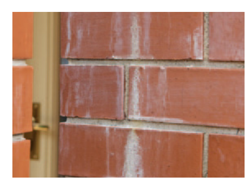
Calcium stains leaching from adjacent concrete balcony