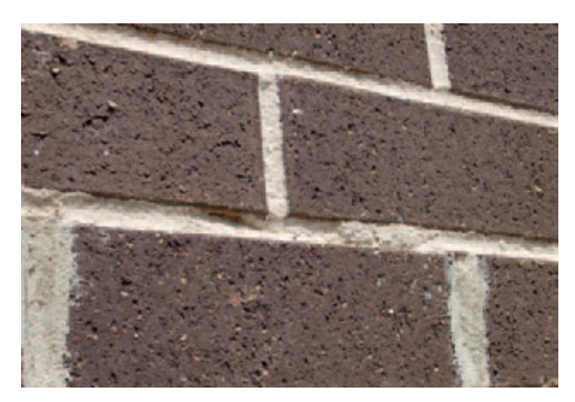
Damage to ironed mortar joint

6. Allow the cleaning solution to remain on the wall to allow the chemical reaction to take place, this could take up to 3 to 6 minutes, however for bricks manufactured in Oueensland and Western Australia a lesser time is advised or secondary staining can occur.