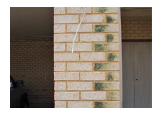
Vanadium as a green stain on light coloured bricks

After the initial removal of vanadium stains, more water on the masonry – even that used in the cleaning process – may induce further efflorescing of the salts to the surface, depending on the amount within the brick