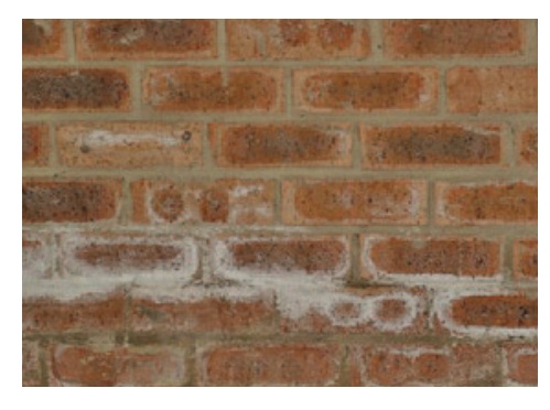
Efflorescence from ground salts