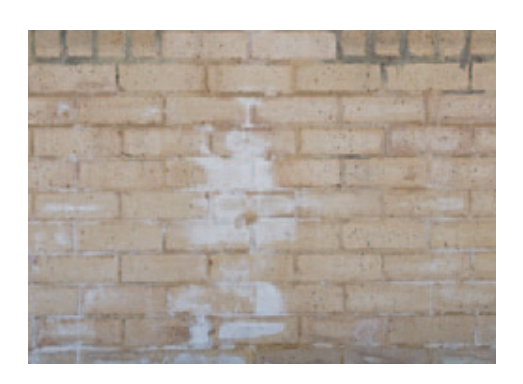
Efflorescence as seen on brick faces

Persistent efflorescence may be a warning that water is entering the wall through faulty copings, flashings or pipes.