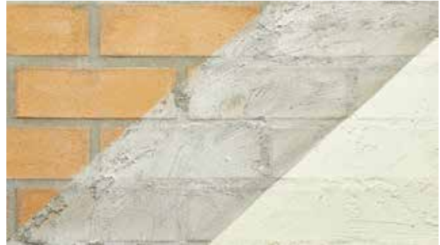
Bagged Joint: Flushed Feature: Bagged Brick: Smooth Painter