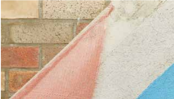
Plaster Feature: Plaster Brick: Plaster brick

The increasing popularity of bagged and painted bricks has meant that some painters have specialised in these brick finishes. When painting over a brick, the bricks need to have cured on the wall with the mortar and be clean, dry and then the correct system needs to be applied.