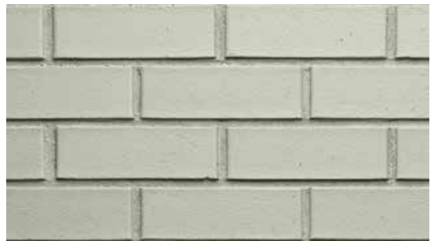
Paint Joint: Raked Feature: Paint Brick: Smooth Painter

Variations in colour, texture and size are natural characteristics of clay products and production variations can occur from batch to batch. Whilst every effort is made to provide samples, brochures and displays consistent with product delivered to site, they should be viewed as a guide only.