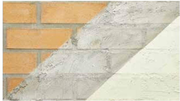
Bagged Joint: Flushed Feature: Bagged Brick: Smooth Painter