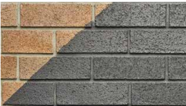
Paint Joint: Raked Feature: Paint Brick: Wire Cut Painter