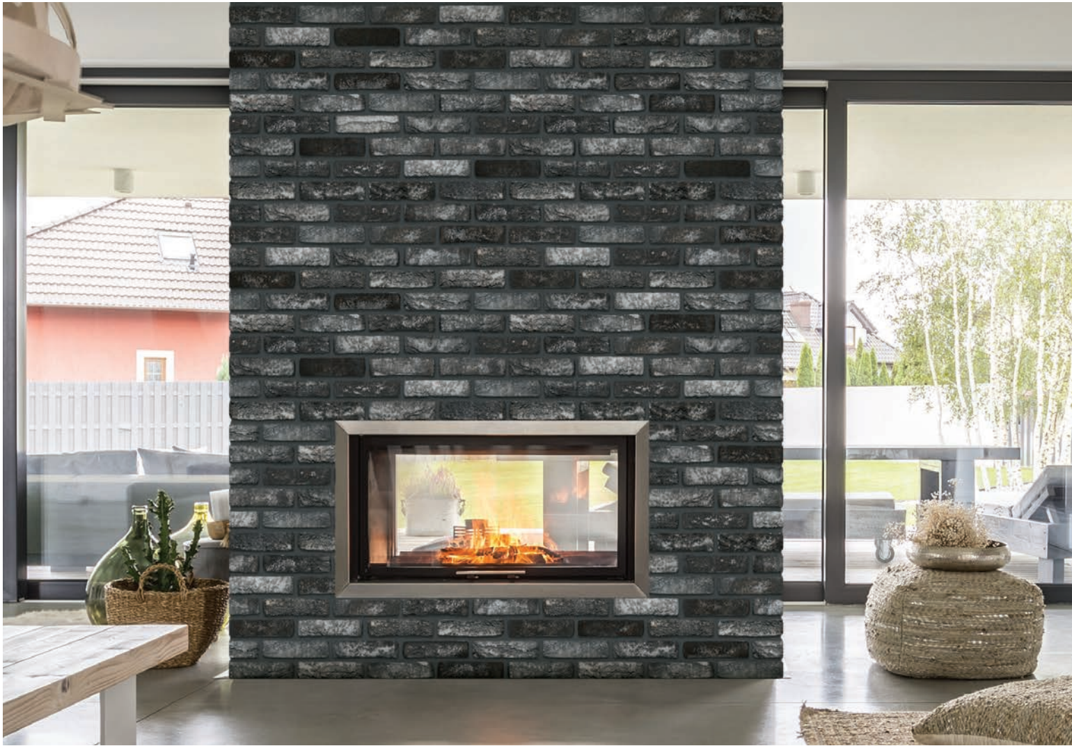
San Selmo Smoked: Wild Storm (non-stocked item) & Grey Cashmere / Cover Image: San Selmo Smoked: Grey Cashmere