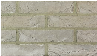
Grey Cashmere** ** Displayed with grey mortar