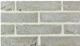
Grey Cashmere* *Displayed with off white mortar