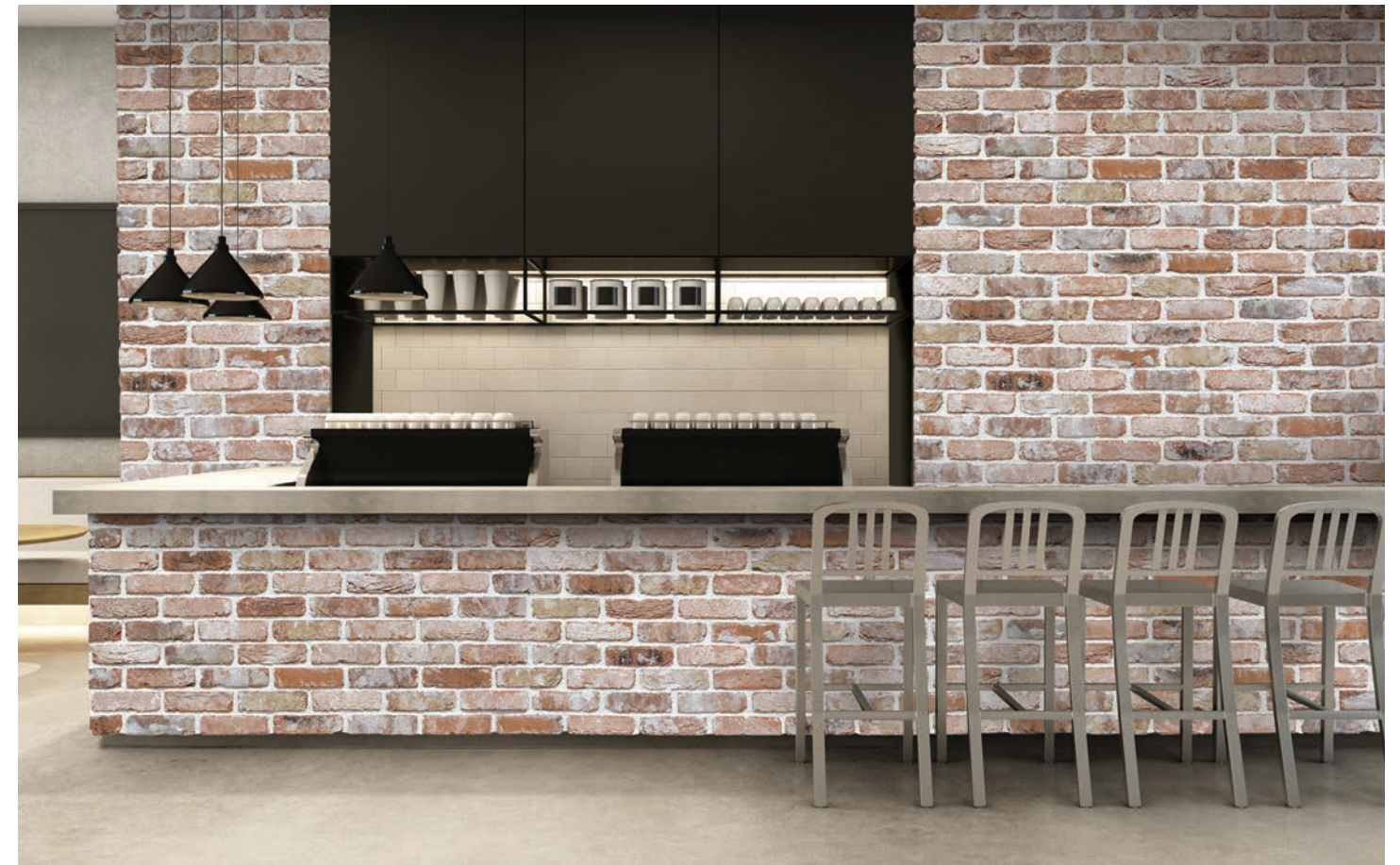
San Selmo Reclaimed

The richly textured San Selmo Reclaimed range brings with it a strong European heritage. These elegant kiln-fired clay bricks are manufactured in Italy and feature a beautiful, tactile surface inspired by recycled bricks. The result is a distinctive rustic finish that will create a genuine warmth in any project. Ideal for both modern and traditional homes.