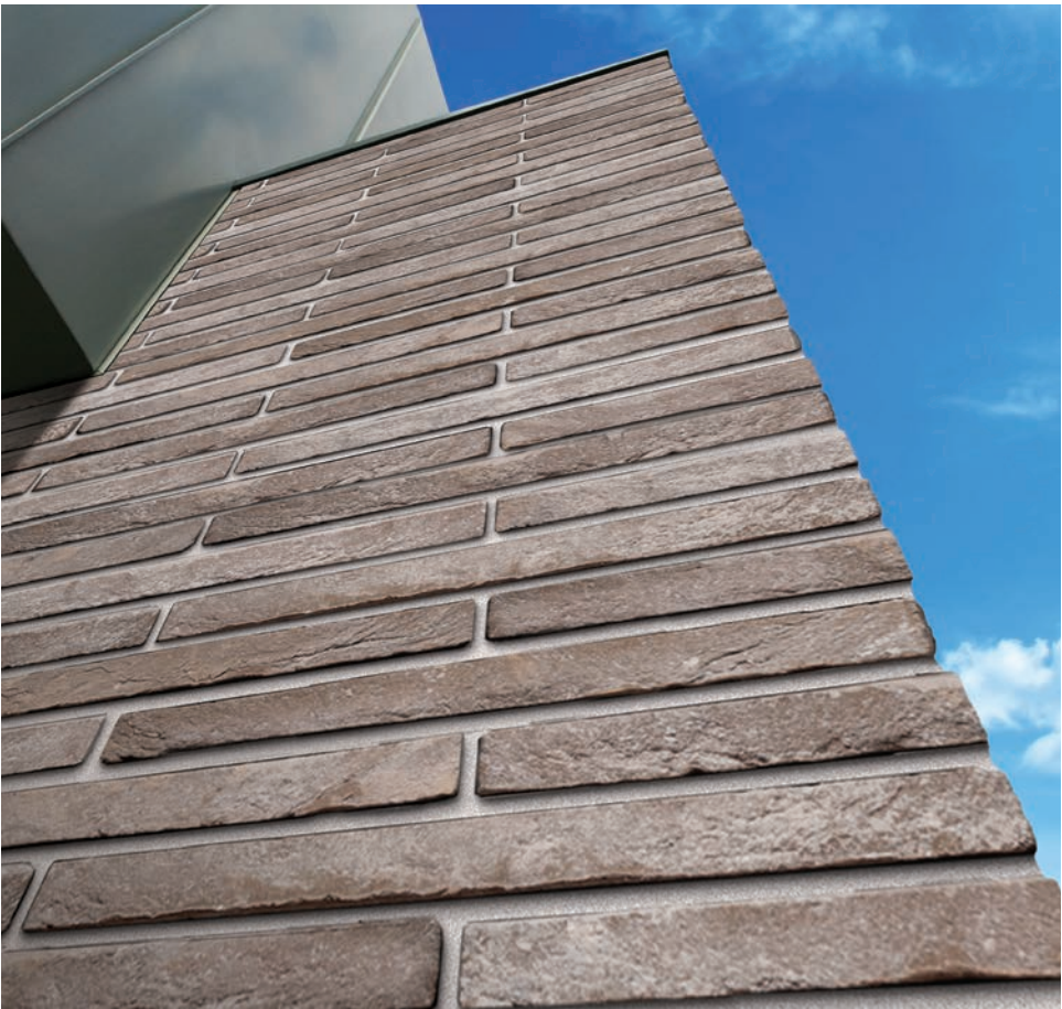
San Selmo Corso Textured: Livenza