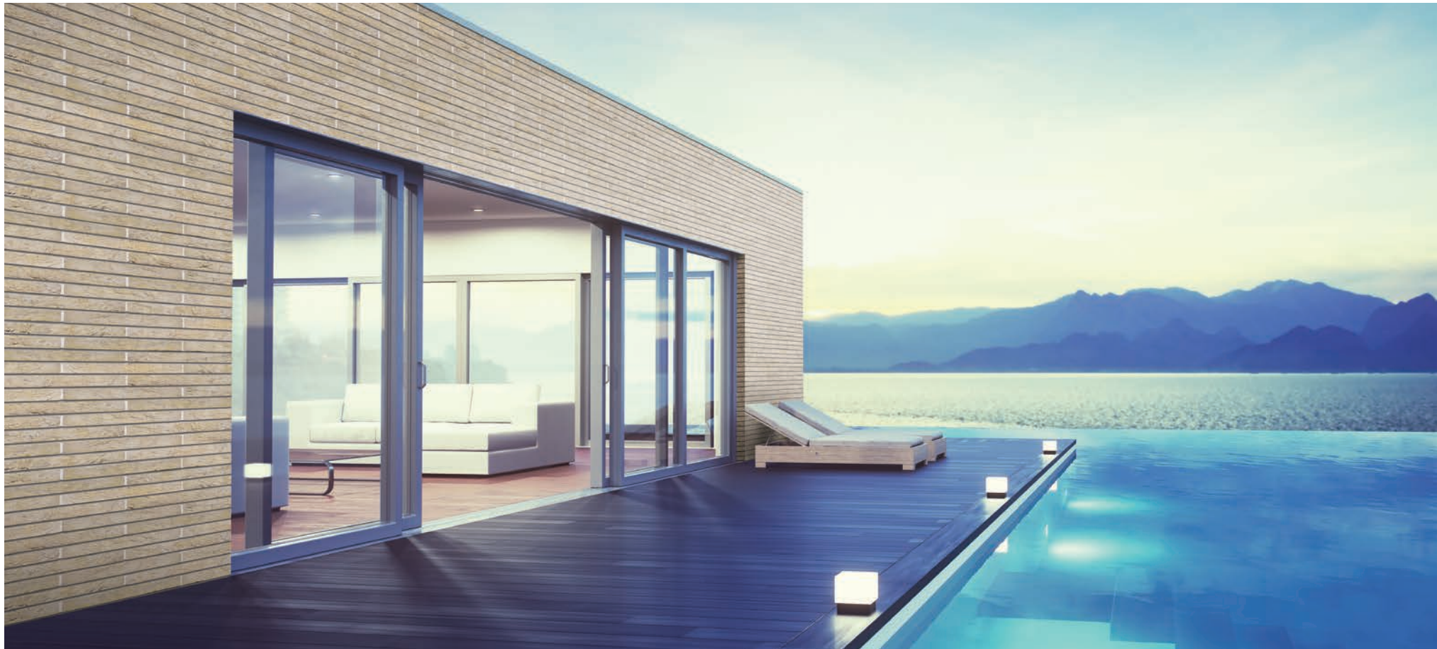
San Selmo Corso Textured: Brenta / Cover Image: San Selmo Corso Textured: Piave